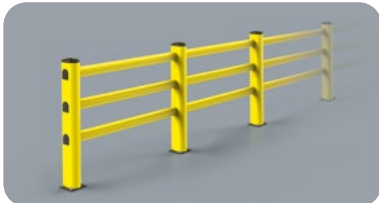
PED 150 2000x1150 MODULAR