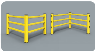
PED 150 2000x1150 CORNER